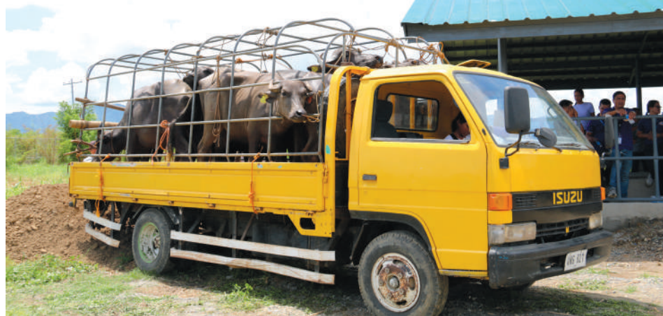
Turnover of 100 female buffaloes to Nueva Segovia Consortium of Cooperatives (NSCC).

similar programs offered by DA-PCC for the province. Singson thanked DA-PCC for spearheading the project and challenged the community to uphold organic farming principles, promote environmental sustainability, and enhance community well-being.