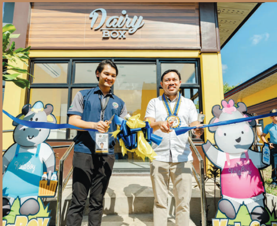
New livelihood opportunities for Negrenses! Senator Mark Villar and Mayor Javier Miguel Benitez led the opening of the Dairy Box which will house a variety of carabao-based products.

Mayor Benitez named the event the “Great Victorias Carabao Moo-vement (Movement),” not just to launch facilities, but to establish a foundation of a prosperous future for the city.