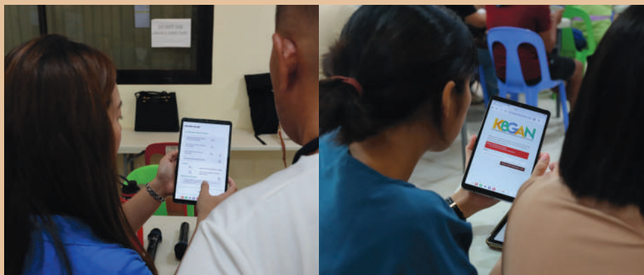
The DA-PCC team demonstrates proper navigation of mobile apps.