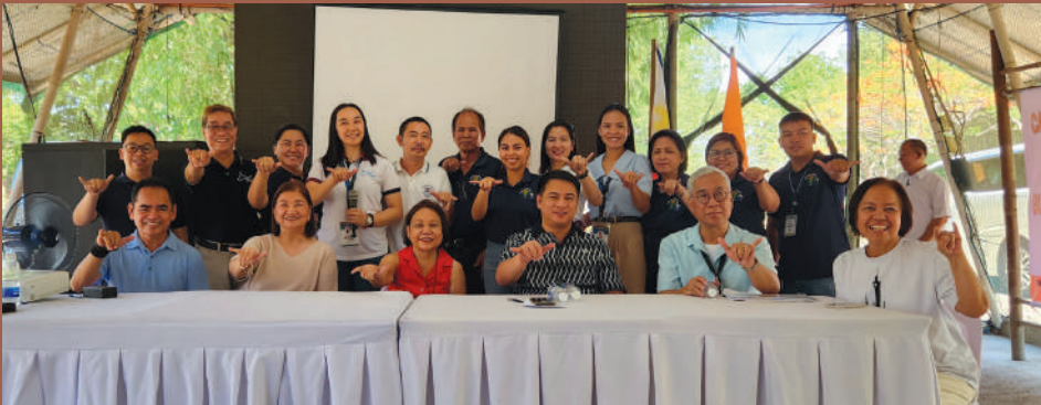
All for one mission—to provide coconut farmers with better quality of life through carapreneurship.

increased income,” held on May 7, 2024, at the Villar Foundation Farm School and Tourist Farm located in Las Piñas-Bacoor, Cavite.