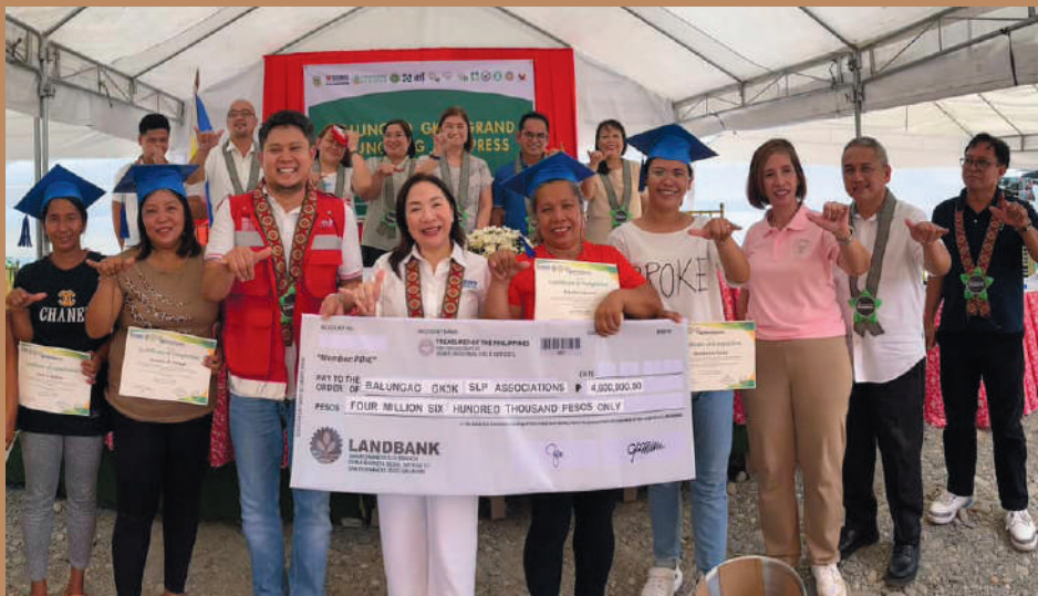
A total of 300 indigent families in Balungao, Pangasinan received PHP4.6 million seed capital from DSWD to help them start up a carabao-based enterprise.

Key government agencies in Pangasinan converged to implement the “Gatasang Kalabaw Kontra Kagutuman at Kahirapan” (GK3K) project in the municipality in Balungao, leveraging the carabao’s role in sustaining livelihoods. The project leverages the carabao as a means for sustainable carabao-based enterprise (CBE).